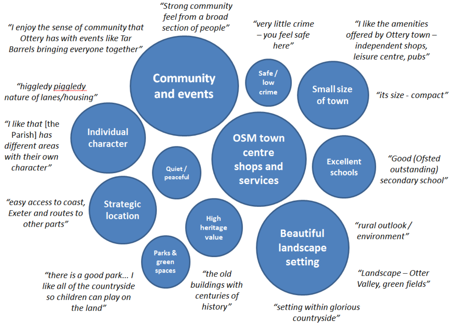
Figure 1: Response to Question 1 - What do you like about the Parish of Ottery St Mary?