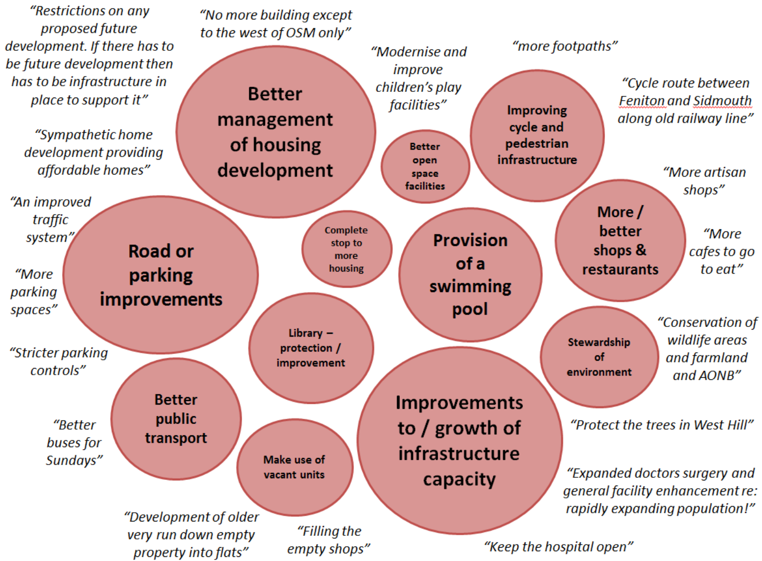
Figure 3: Response to Question 3 - What in your opinion would improve the Parish of Ottery St Mary the most?