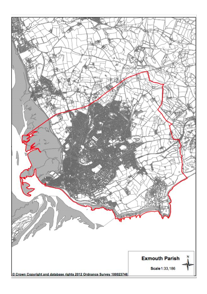
Figure 1 – Designated Neighbourhood Area.

The Neighbourhood Area (as shown in Figure 1 on page 5) was applied for and approved on June 30th 2015 through the process set out in the Neighbourhood Planning (General) Regulations 2012 (Regulations 5 to 7)3 the application and the approval / decision notice are available here Neighbourhood Area Designation.