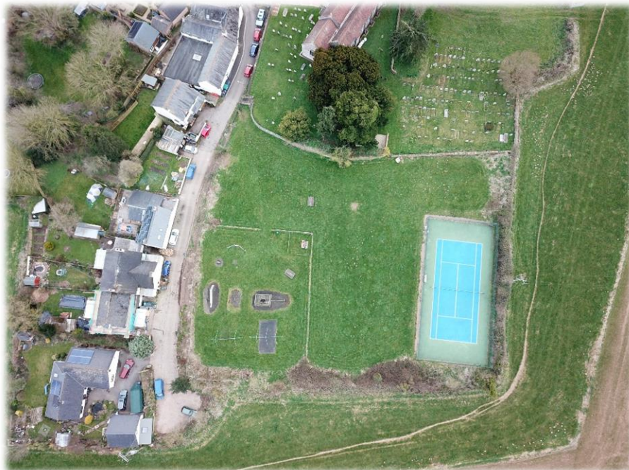
Aerial Photo by Kevin Wooff of Splashdog Media