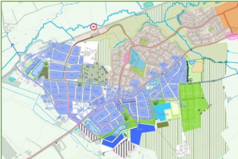
Parcel Plan superimposed on masterplan