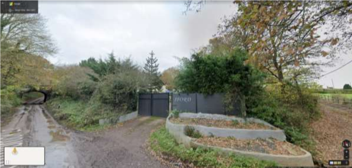
Figure 10: View from entrance to holiday cottages on Southbrook Lane