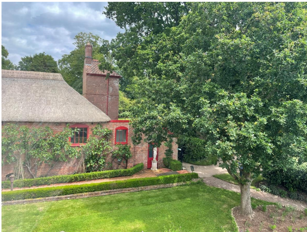
Plate 4 Looking east from A La Ronde towards the site