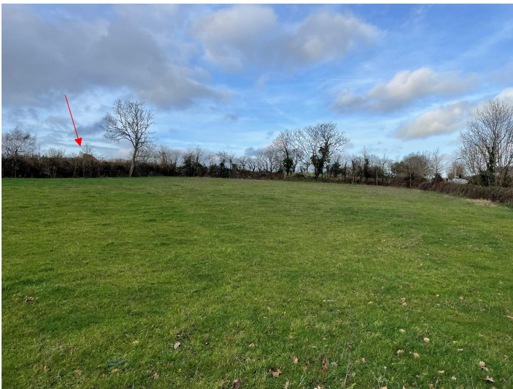
Plate 8 Looking north from within the site, with the Chimneys of The Manse visible