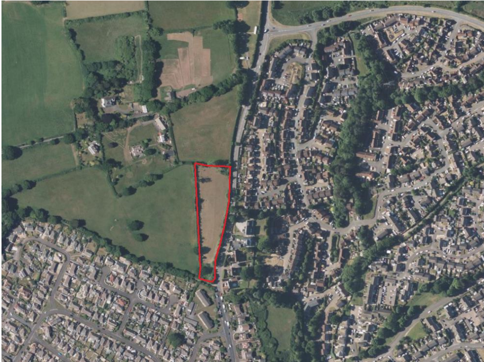
Plate 1 Site Location Plan