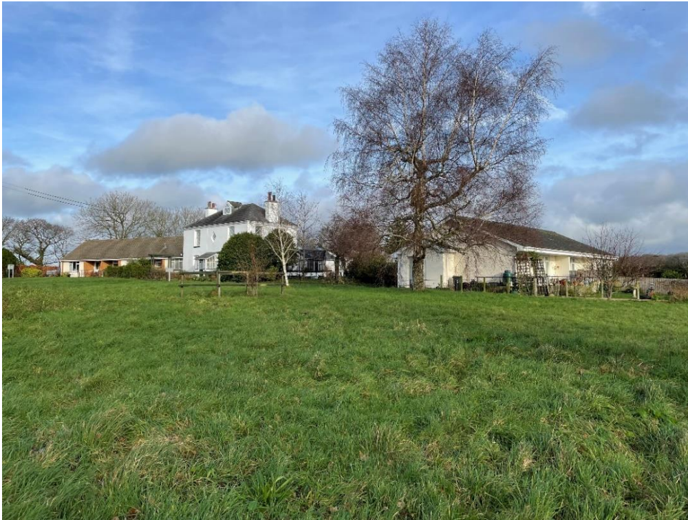
Plate 7 The Manse, with bungalows north and south, looking north-east