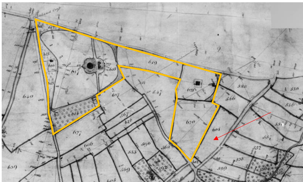
Plate 3 Extract from the Tithe Map showing areas either owned or occupied by Mary Parminter, occupier of A La Ronde outlined in orange