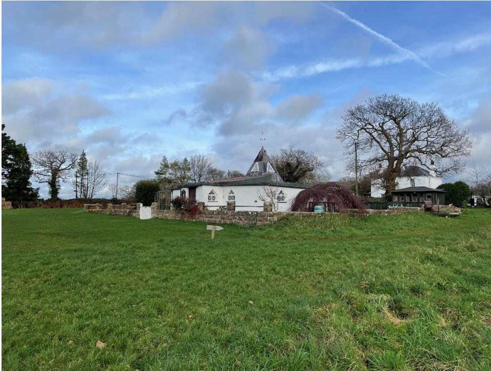
Plate 5 The Point in View Chapel, looking north