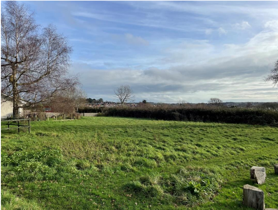
Plate 6 Looking towards the site from close to the Point in View Chapel